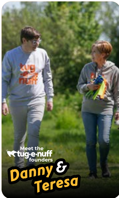
Meet the tug-e-nuff founders