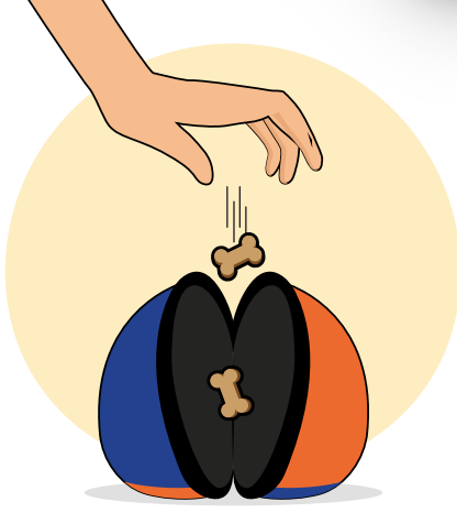
Step 1. Introduce The Clam